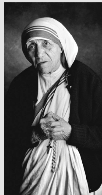
St. Teresa Pray for us!