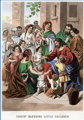
CHRIST BLESSING LITTLE CHILDREN.